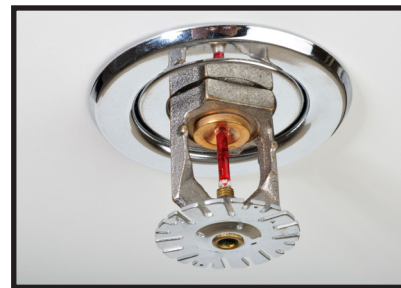
Sprinkler Systems & Fire Pumps