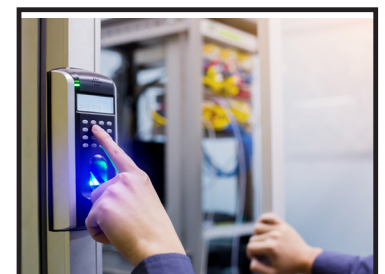
Access Control Systems