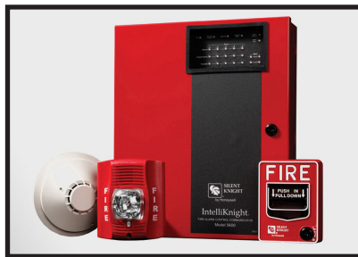
Fire Alarm Systems & Monitoring