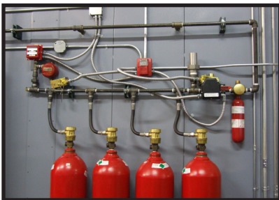
Special Hazard Suppression Systems