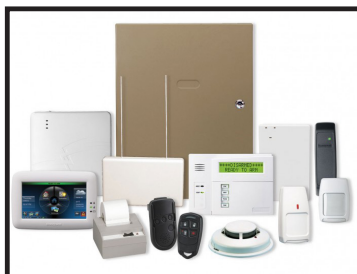
Security Systems & Monitoring