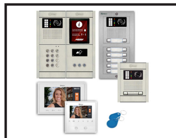
Video Intercom Systems