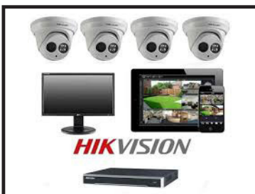
Video Surveillance Systems